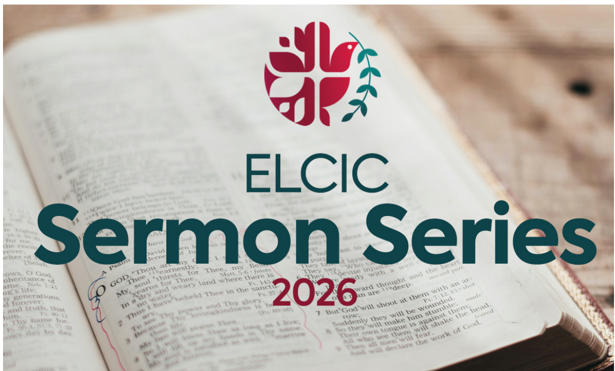
From May until October, Bishops and Assistants to the Bishops are once again sharing