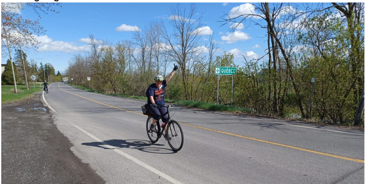
A Pilgrimage for the Planet cyclist enters Ontario near St. Eugene on Saturday, May 10.

Concerned cyclists were pedaling the nearly 200-kilometre trip from Montreal to Ottawa on Saturday, May 10, and Sunday, May 11 as part of the ecumenical Pilgrimage for the Planet organized by the Eastern Synod of the Evangelical Lutheran Church in Canada (ELCIC). The pilgrimage also has participants from Catholic, United, Anglican, Wesleyan, and Quaker congregations. To read the full news story, please click here.